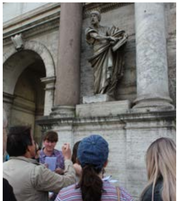
City of Rome's students visiting Piazza del Popolo in Rome, Summer 2024

► British School at Rome, via Antonio Gramsci 61, Rome