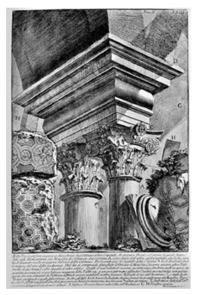
G.B. Piranesi, Interno dell'Mausoleo di Costanza, from Antichità Romane vol. II, BSR collection

Photographic exhibition by Antonio Palmieri, curated by Camilla Boemio. The exhibition will be open until 15 July, from Monday to Friday, 2 - 7 pm