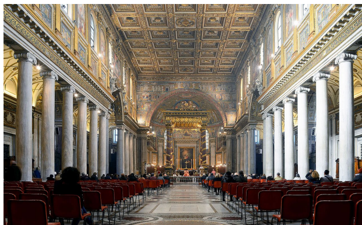
Santa Maria Maggiore, Rome, 434 CE

With the decline of the Roman Empire and the identification of the city as the centre of western Christianity, churches and other important buildings continued to be influenced by or seek to emulate the status of the many surviving Imperial buildings. In many cases, materials and decoration were re-used from ruined or redundant structures. This period became the foundation of the style, now known as Romanesque (or in the Roman manner), that continued across Europe until the 12 th century.