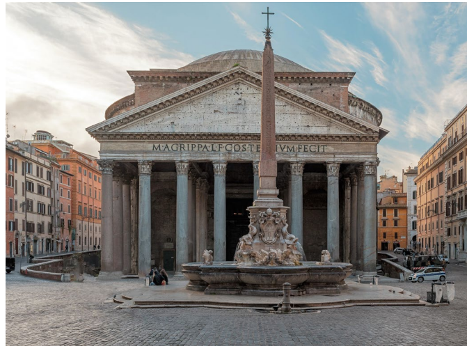
The Pantheon, Rome, c 126 CE

In the following nine centuries, classical architecture evolved to include many of the features we identify today as distinctly classical: the arch, the vault the dome, and the identification and invention of distinct types or Classical Orders. New construction methods and materials were used and influenced this evolution, most notably cement, brick and marble veneers. New classical building types were developed, such as the basilica, the amphitheatre and the villa. This was accompanied by a rich decorative tradition that changed over the centuries.