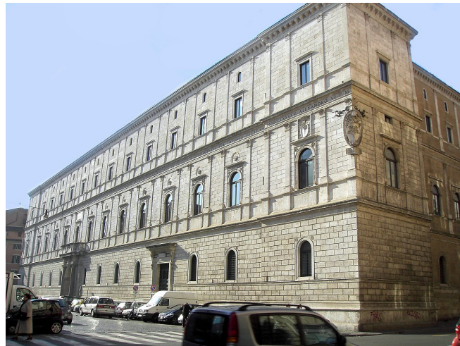
Palazzo della Cancelleria, Rome, 1489

Following a turbulent Middle Ages when other Italian cities became more prominent as city states and a disputed Papacy was located in Avignon, in France, in the early 15 th century an undisputed Pope returned to be firmly located in Rome. This ended the medieval decline of the city and the revival of building and urban planning. This was the period of the early renaissance, when classical architecture was rediscovered in its historic form and contemporary building types were added, such as the urban palace. Either from misunderstood interpretation or simple invention, more features we regard today as distinctly classical were included, such as decorative rustication and the balustrade.