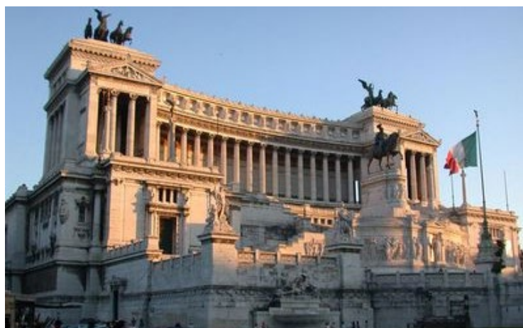
Victor Emmanuel II Monument, Rome, Giuseppe Sacconi, designed 1885

The unification of Italy, the end of the Papal States and the establishment of the city as the capital of the new nation in 1871, led to a burst of building activity that makes up a great deal of Rome today. Planned expansion with new boulevards and public squares held highly original eclectic classical architecture and more restrained interpretations of the renaissance palace to serve as civic, commercial and apartment buildings to cater for the growth of administration and population. By the end of the century and into the 20 th century, more grandiose buildings revived and created a distinctive interpretation of the Baroque which, together with domestic architecture, often included classicised references to Fin de Siècle and Art Nouveau architecture.