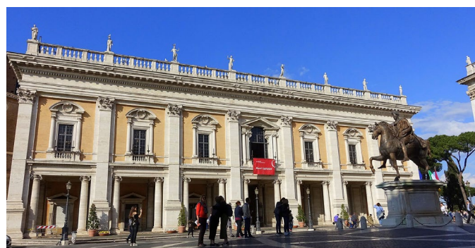
Palazzo dei Conservatori, Piazza del Campidoglio, Rome, Michelangelo, designed 1564

In the 16 th and 17 th centuries, Rome became the centre of new developments in classical architecture. Some of the key buildings in the Mannerist style can be found in Rome, characterised by deliberate invention and complexity, intentionally unlike the rational and orderly interpretations of ancient architecture in the High Renaissance. Important new features such as the giant classical Order, containing other smaller Orders, or decoration like folded leather, were added to the vocabulary of Classical architecture. Mannerism led to the Baroque, an architecture that introduced a new complexity, fragments of classical features combined in elaborate convoluted plans, and were often built at an impressive scale with long urban vistas to maximise their impact.