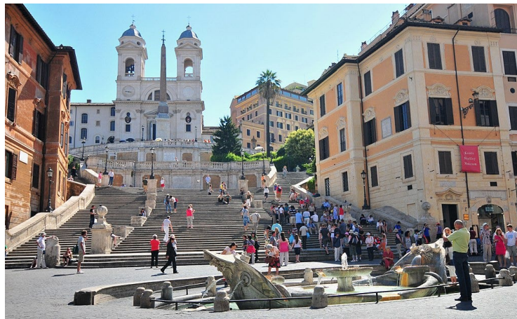
The Spanish Steps, Rome, Francesco de Sanctis, 1725

In the 18 th century, the final throes of the Baroque became the lavish originality of the Rococo, with extravagant decoration, ever more complex plans and intricate urban projects designed like stage sets. Towards the end of the century and into the nineteenth century, a more austere neo-classical architecture emerged throughout Europe. Although inspired by the rediscovery of ancient Greek architecture, in Rome, recent discoveries in Pompei and the ever-present remains of the ancient city, led to a distinctive Roman neo-classicism. This was sometimes combined with a pioneering application of imaginative illustrations of Pompei with new materials such as cast iron and plate glass.