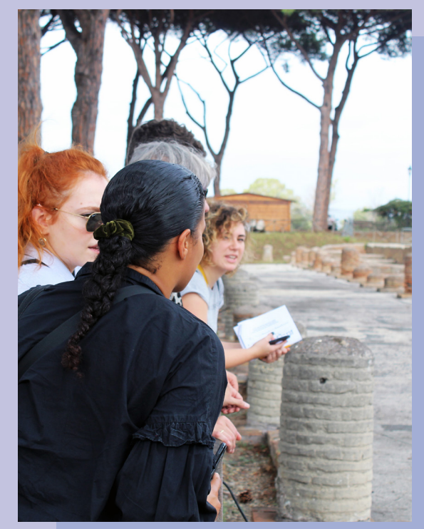
Architects during the Reading Rome course, Ostia Antica, Rome, 2023