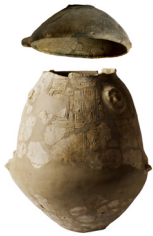
Villanovan urn from the Misericordia Necropolis of Fermo

Reconsidering the Villanovan phenomenon of pre-Roman Italy through an isotope-based perspective: the Fermo and Tarquinia case-study Carmen Esposito (BSR)