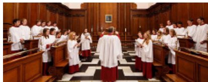
© The Choir of St Catharine's College, Cambridge.

The Choir of St Catharine's College, Cambridge