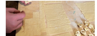
Making tortellini

NOTE: this event will take place at Palazzo delle Esposizioni, Rome