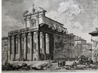
Giovanni Battista Piranesi, View of the Temple of Antoninus and Faustina in the Forum , c. 1750.