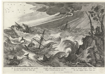
Autumn: storm at sea (1581–1633), Theodoor Galle.