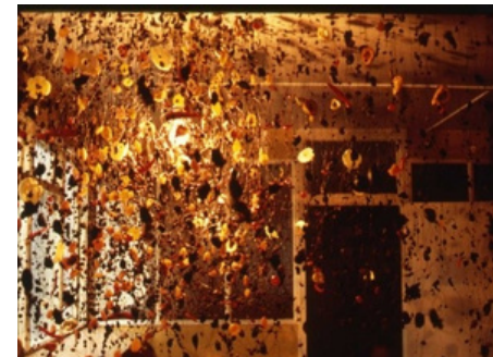
Fruit Swarm 1990, Cornelia Parker.

Artist's talk at the BSR for International Women's Day Cornelia Parker CBE RA