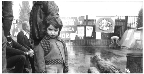
Picket line at Fiat, Turin, 1980