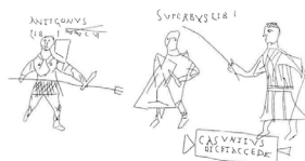
1021 Rom. Paedagogium: Raum 8. H. 20cm

Gladiatorial graffito, room 8, Paedagogium, Rome (AE 1989, 64).