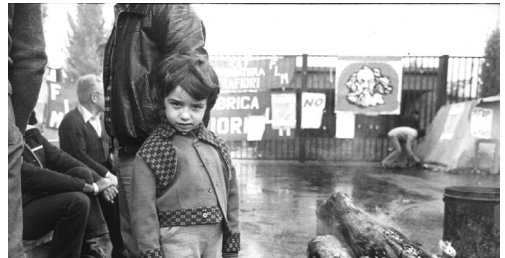
Picket line at Fiat, Turin, 1980