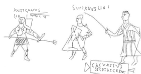
1021 Rom. Paedagogium: Raum 8. H. 20cm

Gladiatorial graffito, room 8, Paedagogium, Rome (AE 1989, 64).