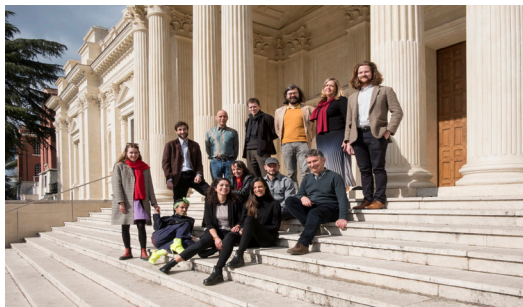
Award-Holders 2021–2 (January–March) on the front steps of the BSR.